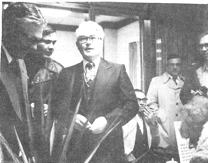
OFFICERS AND BOARD OF DIRECTORS--Of the American Security Bank of Mt. Pleasant were on hand for the Grand Opening in Beal City Monday morning.