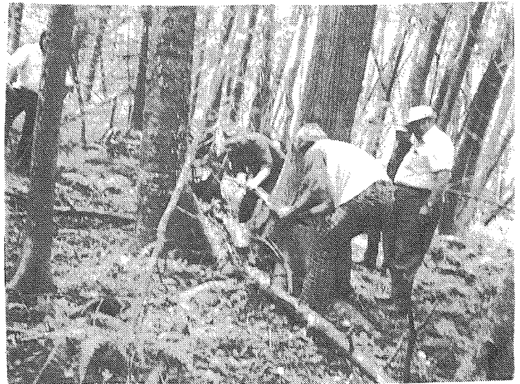
A COUPLE OF SHERMAN TOWNSHIP MEN--Started on a fair-sized tree with cross-cut saw, by hand, until the one chain saw could be got in working order.