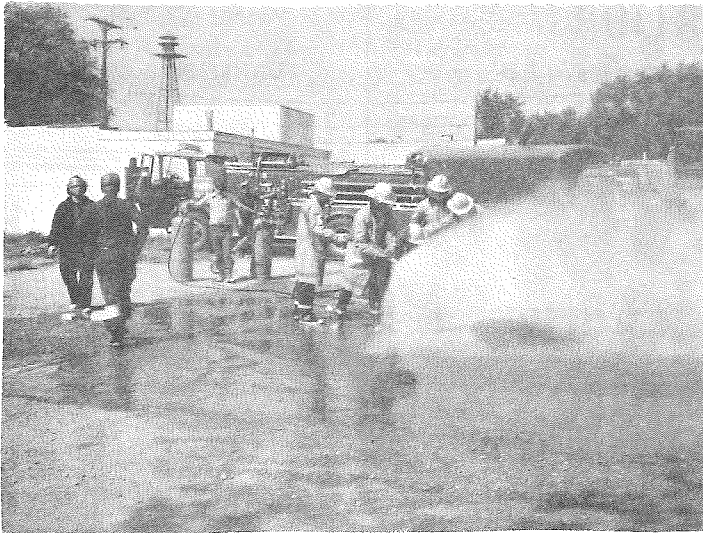
THEIR EXPERTISE IN EXTINGUISHING A GAS FIRE-- Their last active training test, qualifies the Nottawa and Sherman Township Fire Department as a state Certified Fire Department, a coveted status. Seven-man teams practiced putting out gas fires Saturday. After their certification, any new volunteers to the Fire Department must take the same 66-hour training course. Their graduation as Certified Firemen will take place at the Weidman School at 7 p.m. June 8. Be there to see our Firemen get the recognition they deserve.