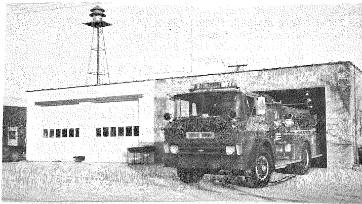
THE NEW FIRE TRUCK--For the Nottawa and Sherman Township Volunteer Fire Department, and also the new addition the Firemen built evenings and weekends to house the equipment. The addition is fully as large as the original fire hall, and the Firemen worked like beavers to get it up in time for arrival of the new truck. Volunteers other than Firemen also helped on the building of the addition.