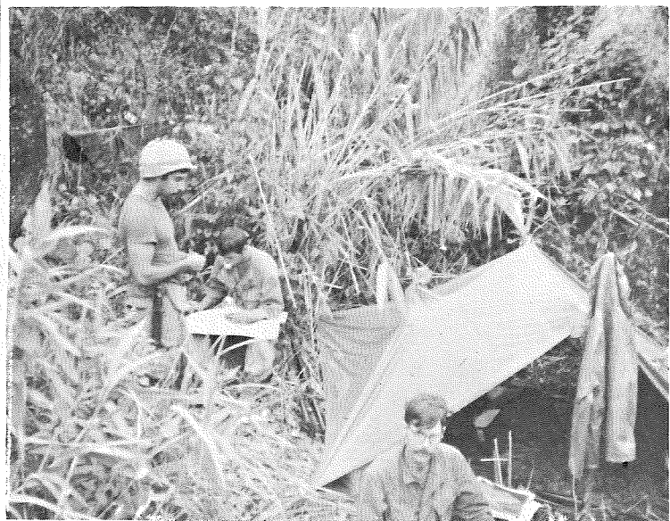
"OUT IN THE BUSH"--In Vietnam. Here's the way American soldiers live on their sometimes extended stays in the jungles. The photo had no caption, but we think it speaks for itself, and for the men still in Vietnam.

The Taxpayers' Association has a sample copy of a "Paid Under Protest" letter which protests and questions the legality of the 1.5 mill over-levy of 1970 taxes. Information may be obtained by