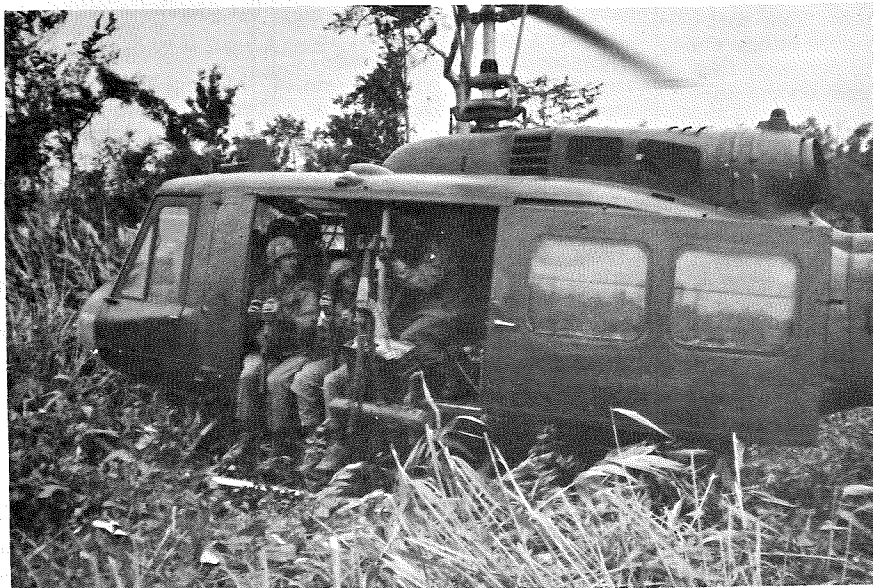
GIs SCRAMBLE OUT OF A JUST-LANDED HELICOPTER--Some-where in Vietnam.

(Editor's Note: We have received the following informative letter from Sp/5 Bruce Reed, stationed at Da Nang, Vietnam. We're printing excerpts from the letter pertaining to life as a service man in Vietnam, the war, and what the GIs think.)