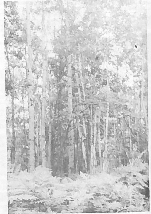
Summer on the Island, Roe's Acres