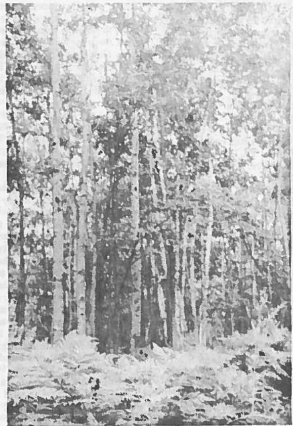
SUMMER ON THE ISLAND, ROE'S ACRES.