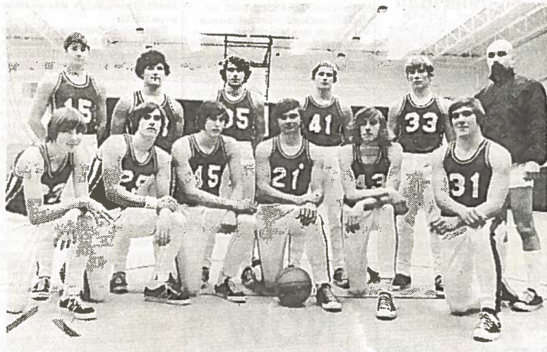
Beal City varsity team