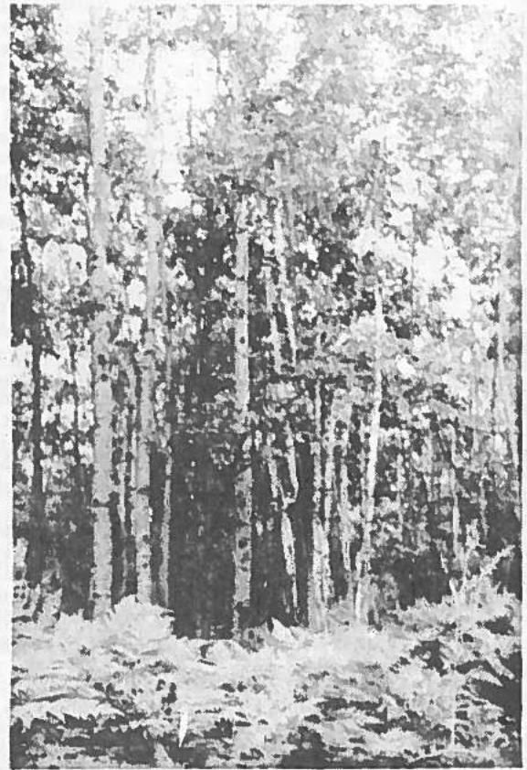
SUMMER ON THE ISLAND, ROE'S ACRES.