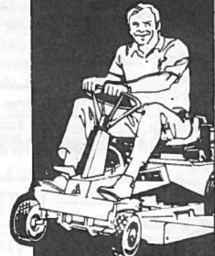
5 and 8 hp. rear- engine riders