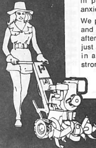
3, 5, and 8 hp. rotary tillers