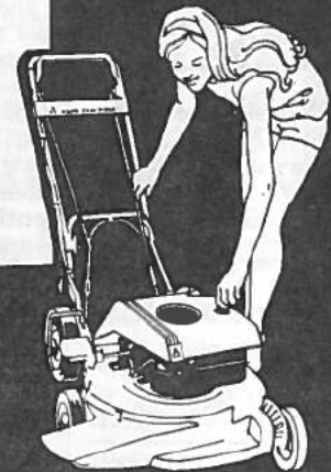
19" and 21" mowers