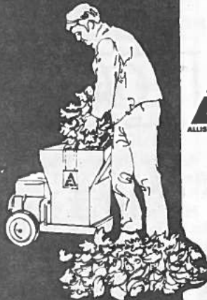
Leaf mills and composters