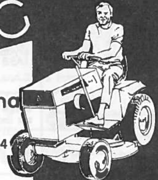
8, 10, 16 and 19½ hp. tractors

We plan to keep our "NEW and STRONG" attitude long after our store opening is just a memory. So, come on in and let's start a new, strong friendship.