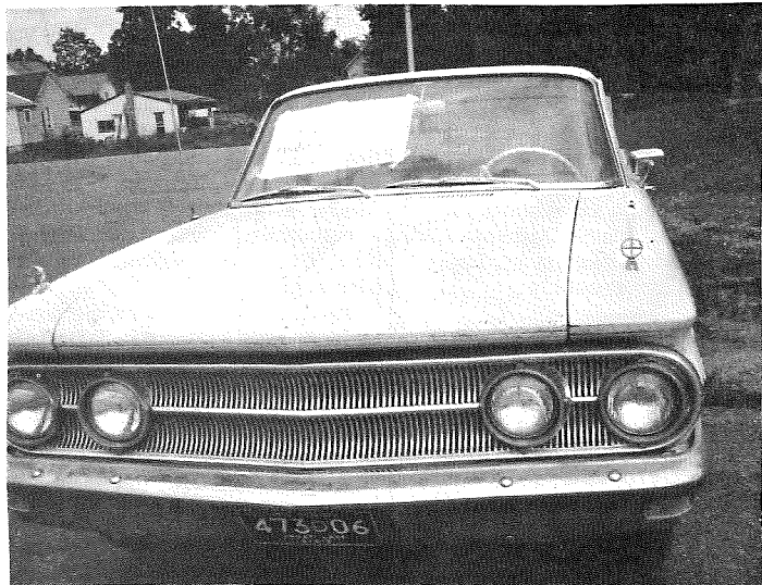
McCLAIN CHEVROLET DONATES CAR FOR AUCTION--The McClain Chevrolet Sales and Service of Barryton donated a Comet sedan to the Methodist Church annual Auction Sale in Weidman. The Methodist Auction is a really big event, and countless items of every description, large and small, are auctioned off.