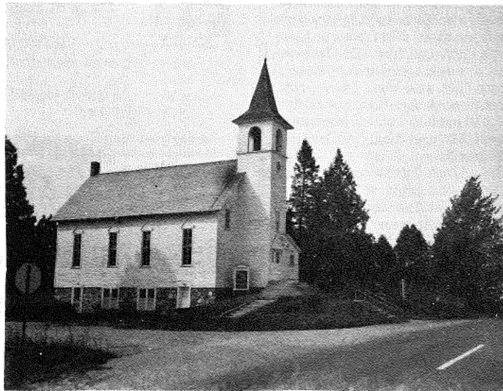
FROM THIS--The old Broomfield Lutheran Church, church members went, after morning services Sunday,

Feeding of livestock probably will become a major problem,