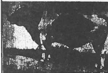
Coffeydale Sir Beas PEARL — 1029659 (GP)