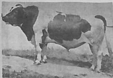
Coffeydale Sir Bess PEARL -1029659 (GP)

Michigan Artificial Breeders Co-operative, Inc.