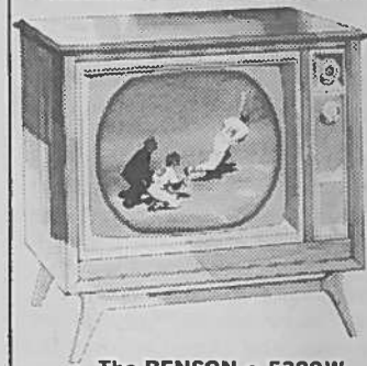
The BENSON • 5320W

Distinctive Danish Modern "lo-boy" styling in genuine oil finished Walnut veneers and select hardwood solids. Zenith quality twin-cone 5" x 3" speaker. $519 95