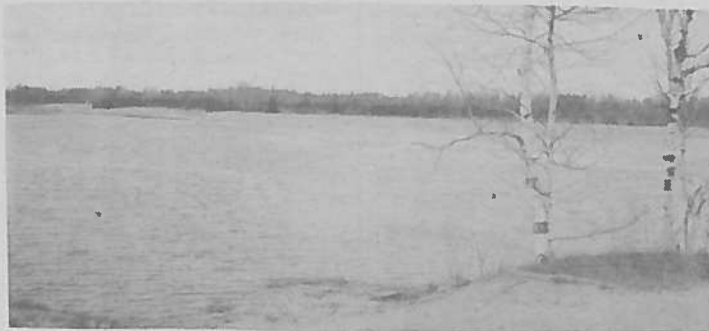
WATER IN LAKE OF THE HILLS!--Real water, that is, and the lake is filling rapidly. Above scene is on one of the many arms or bayous of the lake, and the far shore is covered with trees. Looking northwest from the dam, the expanse of water is large and wide. A cement walkway over the dam was installed last week. Messenger photo.

Besides the animals, Charlie lost a wagon, chain saw, feed grinder, and a fanning mill in the blaze.