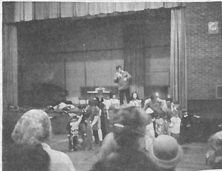
PRINCIPAL HOWARD AWARDS PRIZES--For best costumes at the party.