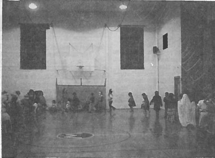
PARADE OF HALLOWE'EN COSTUMES--At the party Friday night at the Weidman School. About 250 kids had a great party and a full evening of fun.