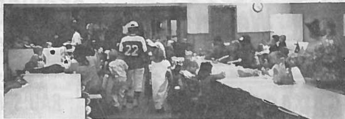
IN THE CAFETERIA--Where all sorts of good things to eat were ready for kids' enjoyment. One could in and out at any time, and get Hallowe'en refreshments. It was a total-enjoyment evening.