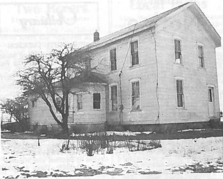
A REMINDER OF VANDECAR TOWN-- This ancient building is all the visible remains of the once-promising town of Vandecar, four miles east of Weidman on Weidman Road and Vandecar Road.