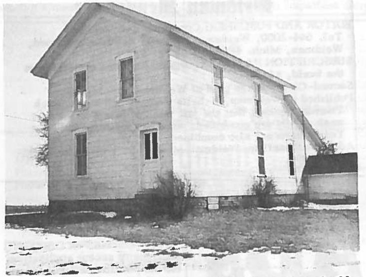
A VIEW OF THE EAST SIDE-- Of the old rooming-house building of the once-promising town of Vandecar. Its cut-stone foundation is as solid today as the day it was laid down. Now it is used as a rental unit for transient families. They built well, in the old days.