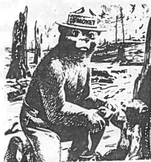
Forest fires hurt us all!