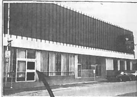
The most convenient "spot" in town.

It's the spot where you can push a little button for an easy entrance into the Trust Department at Isabella Bank and Trust. No steps to climb, no heavy doors to pull open, and with an inclined ramp on the inside for easy accessibility, not only to the Trust Department but to all other departments in the bank.