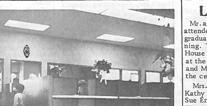
A SMALL NUMBER OF THE MANY--Who were guided through the bank's inner security and convenience places, at Saturday's Open House, is shown above.