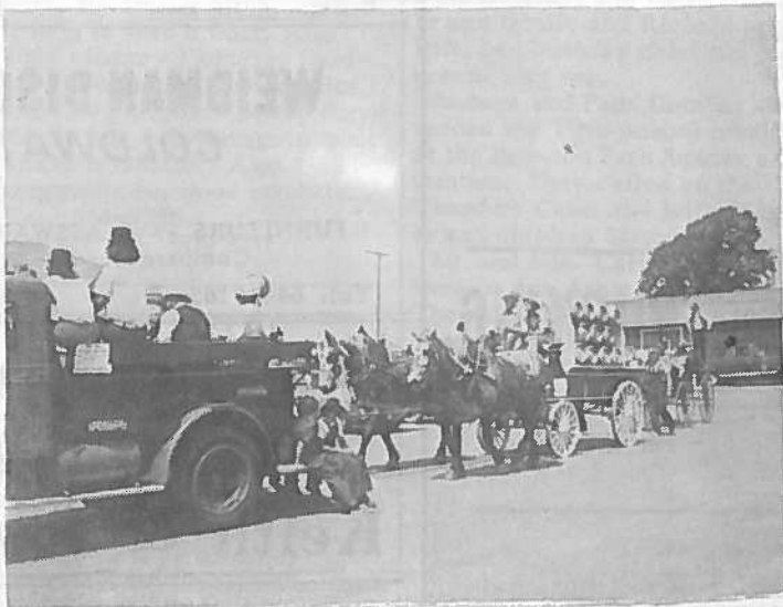
THE "MILK RUN" ARRIVED IN BEAL CITY ON TIME--And in real style. Beal City's celebration of its Centennial goes on all this week, ending this coming Sunday night. Nottawa people have worked two years in preparation for it. Their well-organized efforts have really paid off. A big event was the Michigan State Lottery drawing at the Knights of Columbus parking lot in Beal City at 2 p. m. Tuesday of this week.