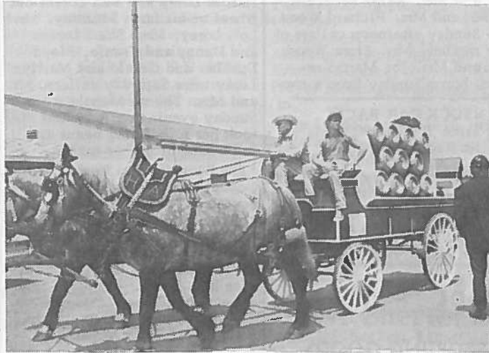
SCENES FROM BEAL CITY'S FIRST DAY OF CELEBRATION--Of its Centennial. Here's the "milk run" truck that made a trip from Mt. Pleasant to Beal City with its load for the beer tent.