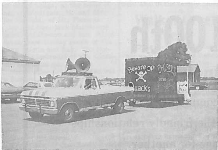
HERE'S THE "MEDICINE WAGON"--That accompanied the Milk Run. It's advertising "instant cures" on its side panels.