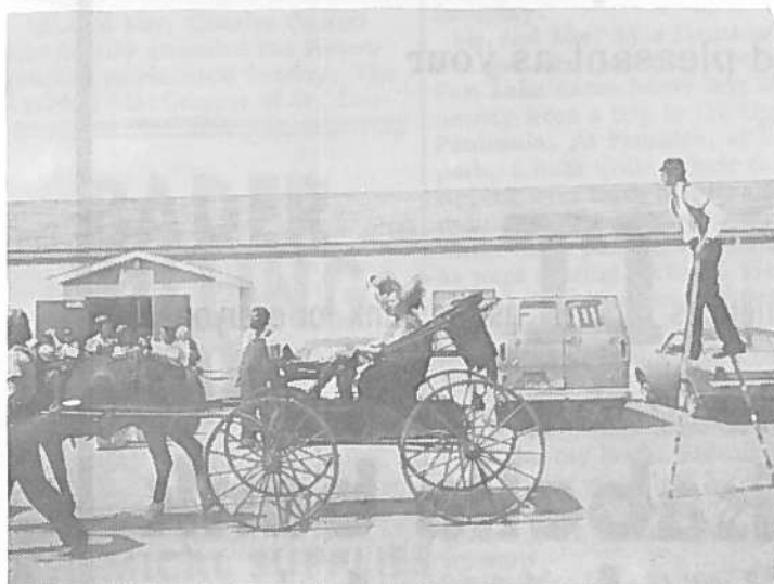
DEE LAWENS DRIVES A BUGGY--Of ancient vintage, while being followed by an expert on stilts. Beal City has just about everything from the old days. Huge crowds have been in attendance each day and night.