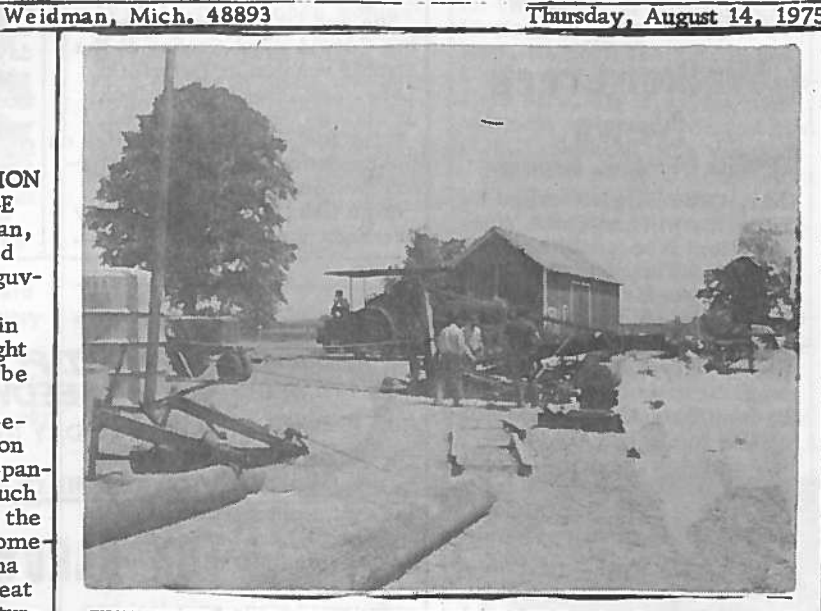
THE FIRST SAWMILLS LOOKED LIKE THIS--As shown during the recent Beal City Area Centennial celebration. The sawmills were crude portable contraptions with no safeguards for workers. Take a look today at Weber Bros. mill at Beal City or Maeder Bros. mill at Weidman, and you'll see sawmills still going strong, but in the modern manner.

from the Michigan Employment Security Commission (MESC), which we cannot use as we don't have room for state-wide news or so-called news that is covered by bigger papers anyhow.