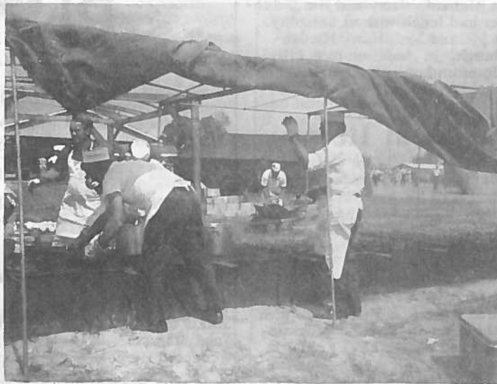
THEY'LL BE ROASTING CHICKENS AGAIN--At the annual Beal City Knights of Columbus Chicken Barbecue, set for next Sunday, Aug. 31, at the spacious K. C. Hall in Beal City. The event annually draws great crowds of people from all parts of Michigan, and the day is livened by games and entertainment.

We have the names of the two teenagers who have been growing