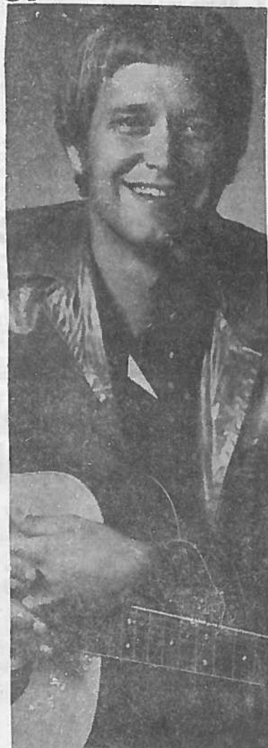
REX ALLEN Jr