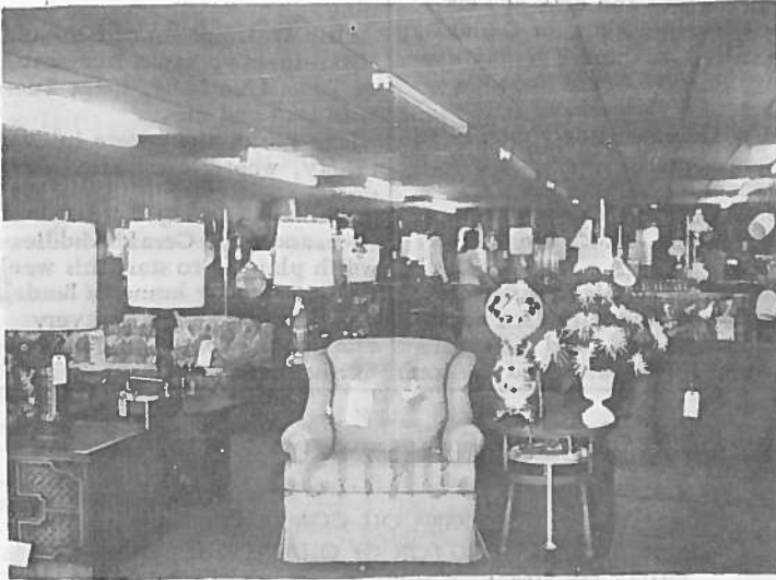
A CORNER OF THE HUGE NEW ABBOTT FURNITURE STORE-- Shows uncluttered settings of appropriate groupings of living area furnishings.