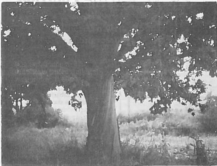
A FIFTY-YEAR-OLD OAK TREE WAS STRIPPED OF BARK--By lightning sometime this summer. The huge tree will die, according to knowledgeable folks. Lightning apparently just took all the bark off the entire tree, with some slight damage to a few limbs up high. A large hole at the base of the tree is believed to show where the lightning bolt went into the ground. The tree stands in a corn field on the Portenga (Gray) farm, and Lyle Denslow was helping harvest the corn when the damage to the tree was discovered. The field, and the-struck tree, are very close to barns on adjacent farms.