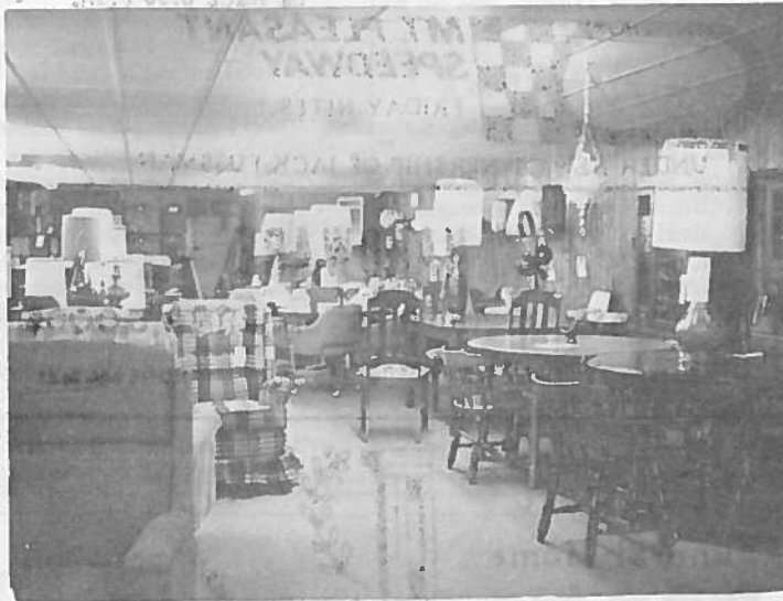
ANOTHER SMALL SECTION OF THE BIG STORE-- Shows dining room furniture tastefully arrayed.