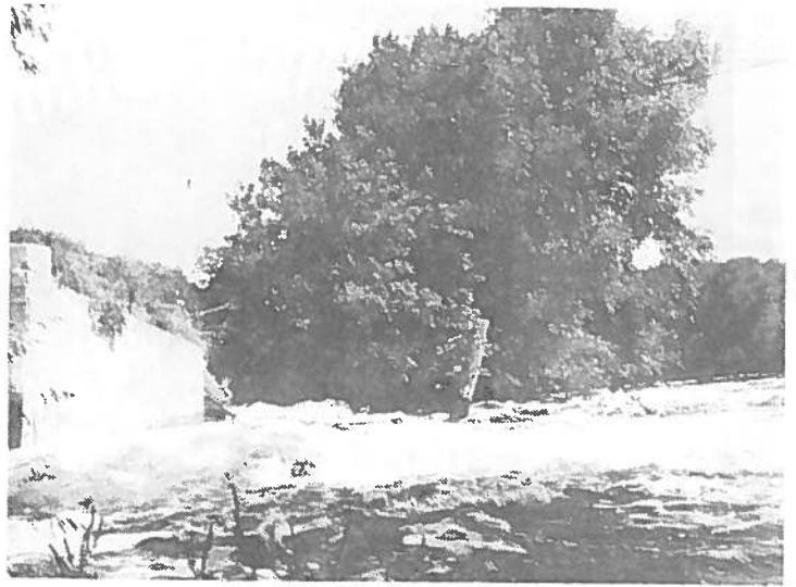
BELOW THE DAM--At the mill, waters surged furiously on their release and the fall, under the road. The Mill Pond was not flooded, but it was at near flood stage. Messenger photo s

Buy and Sell through Messenger Want Ads.