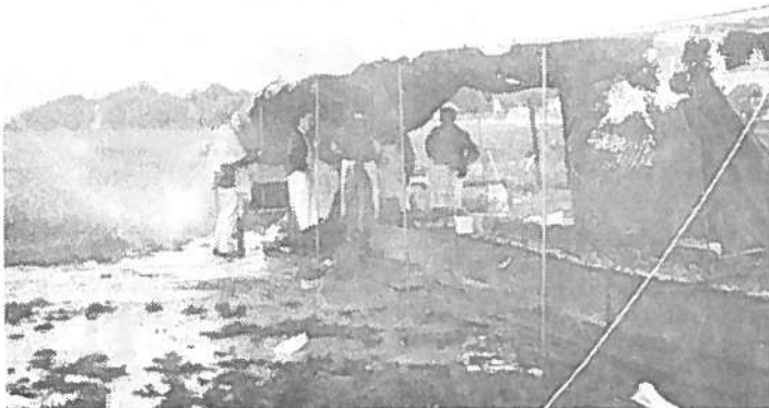
BARBECUING CHICKENS IN THE RAIN--Was the order of the day Sunday for Beal City Knights of Columbus, who served a surprisingly good number of dinners, considering the worst holiday weather in years.

At Beal City Sunday, when the Beal City Knights of Columbus staged their annual chicken barbecue and all-day entertainment. Crowds were surprisingly good, considering the Labor-Day weekend weather. The dinner was enjoyed as usual inside the spacious KC Hall, with the delicious freshly-done chicken and all the trimmings including home-made pies for dessert.